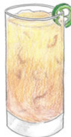
Spicy Paloma El Jimador tequila, lime, jalepeno grapefruit syrup, St. Germain, grapefruit soda