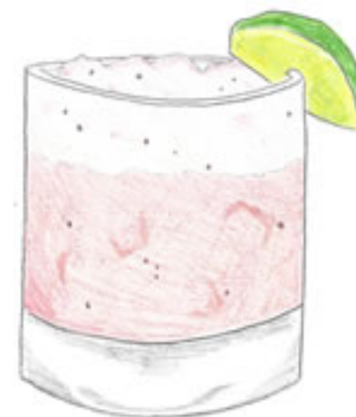
Rizzo white rum, vanilla syrup, lime egg white, pomegranate syrup, soda