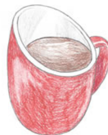
Irish-ish Coffee steamed cold brew, Jameson Averna cream liqueur, sugar