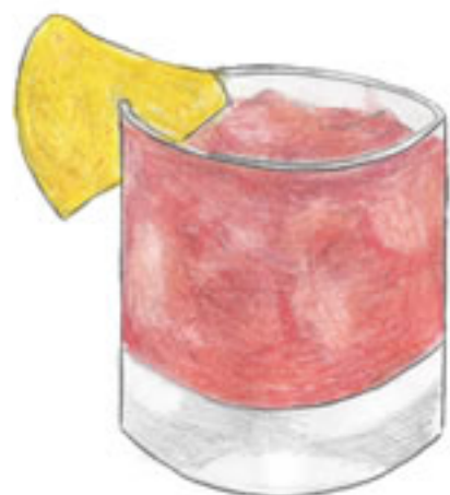
Red Rum Ron Matusalem, lime, Yellow Chartreuse hazlenut syrup, Pechaud's bitters,