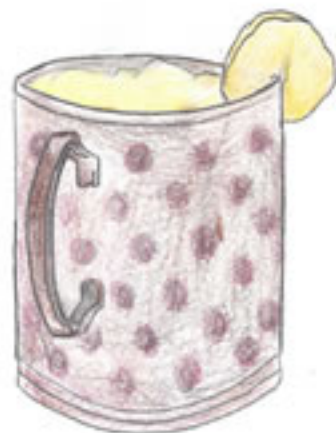
Gin Gin black tea and red chai infused gin, housemade ginger beer

made with premium liquor, freshly made juices, and house-made syrups