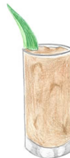
Chai Mai Thai white and dark rum, orgeat syrup chai tea, pineapple juice