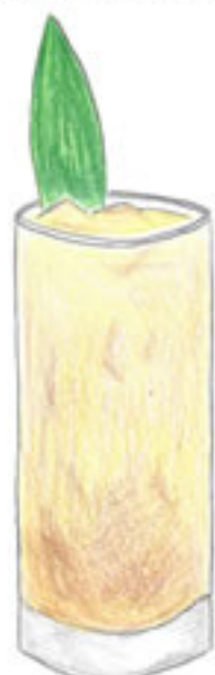
Beach Comber ginger infused rum, orgeat St. Germain, Pineapple juice