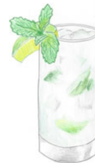
Sake Mojito Ozeki Nigori sake, honey, mint, lime, soda