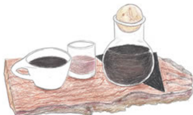
Whiskey Coffee Pairing ($10) our fine pour over coffee matched with a bourbon or rye