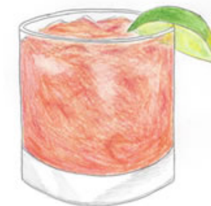
Blood Orange Margarita Tequila, blood orange, lemon, lime, simple syrup, brandy

Old Favorites: Moscow Mule, Captain Ron, Highland Sting, Citrus Negoni