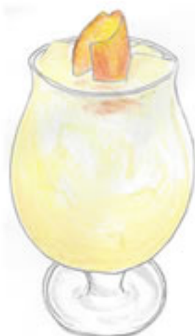
White Sangria White wine, lemon, brandy, honey, simple syrup, ginger beer