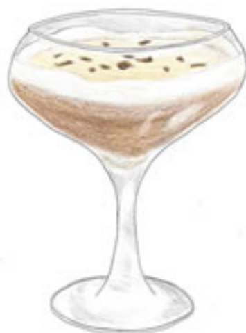
Chimera Fizz Bols Genevere gin, Prairie Dark cinnamon, egg white, cold brew, vanilla,