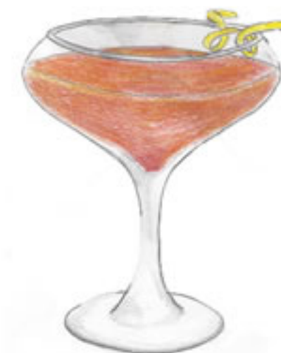
East End Apple infused whiskey, pear brandy, lemon carpano antica, pomegranate, Pechaud's bitters