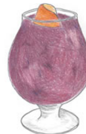
Red Sangria Cabernet Sauvignon, lemon, blood orange, brandy, ginger beer