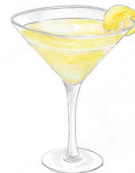
Parigot Prairie Wolf Vodka, St. Germain, lemon, pineapple, lavender-orange bitters