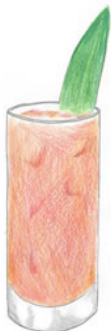
Chimera Cocktail Tea infused gin, blood orange fallernum, pineapple, ginger beer