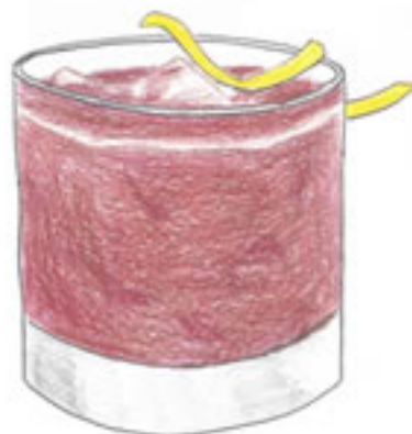
Port of Spain Sour Templeton Rye, orgeat syrup Angostura bitters, lemon